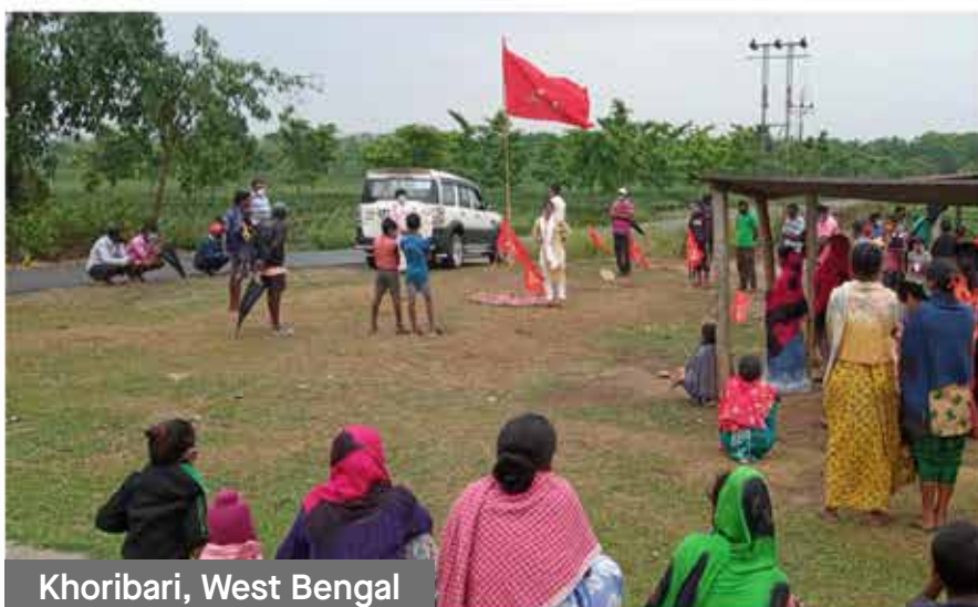
Khoribari, West Bengal