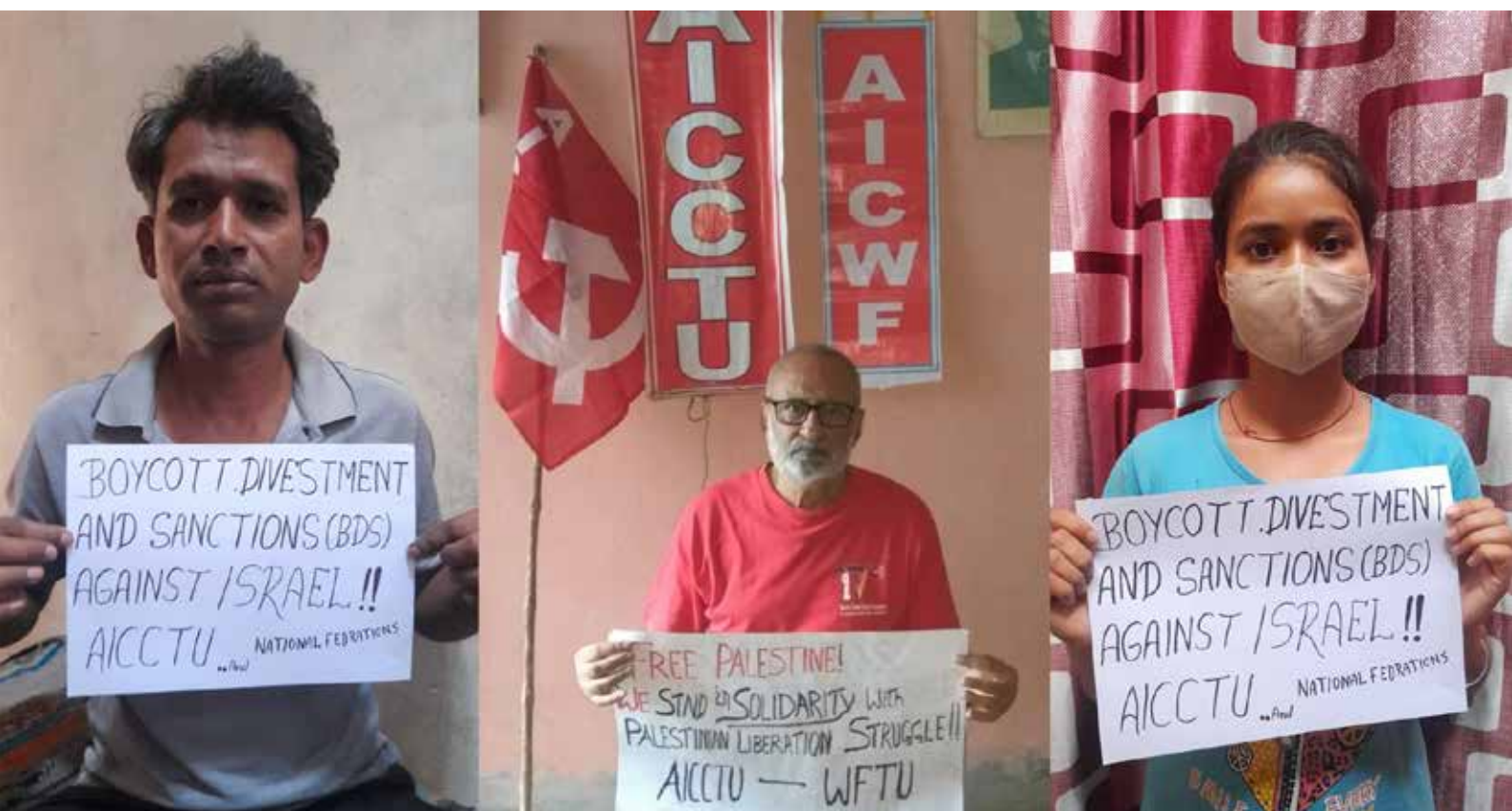
AICCTU members observing National Day of Solidarity with the People of Palestine and Condemnation of Israeli Aggression on 28 May 2021

As the Palestinians continue to resist the Israeli brutality, apartheid and military occupation, AICCTU reiterates its complete solidarity with the people of Palestine and their struggle for liberation. We also reiterate our support for strengthening the global Palestinian call of Boycott, Divestment and Sanctions (BDS) against Israel. ■■■