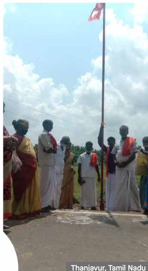
Thanjavur, Tamil Nadu