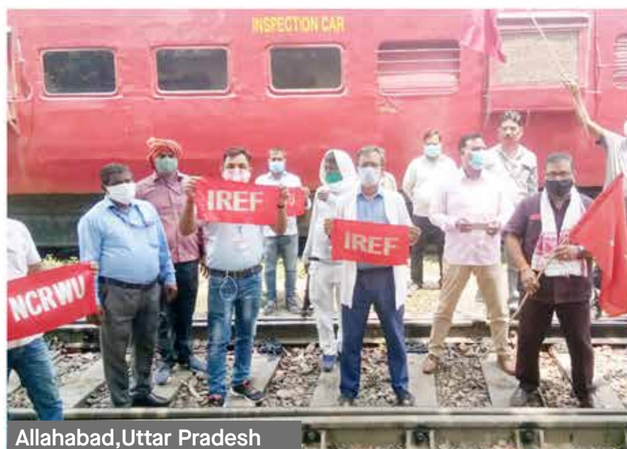
Allahabad, Uttar Pradesh