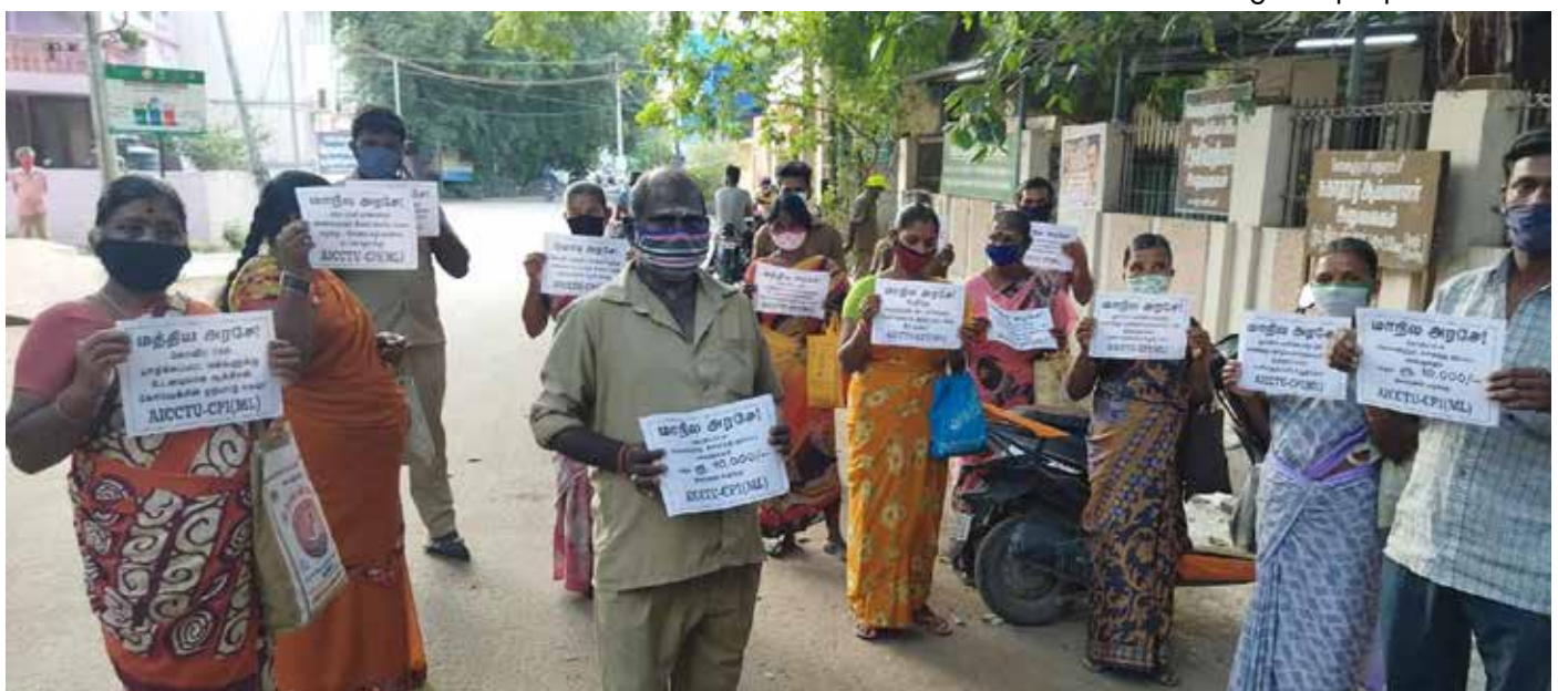
Sanitation workers' protest in Coimbatore on 18 May

AICCTU – CPIML observed hunger strike in many places including Tuticorin on 22 May 2021 and also as a part of the Global Action Day Against Vedanta demanding arrest and stringent punishment for perpetrators of the crime and to permanently close down Sterlite factory which was also one of the promises of the DMK in the just concluded elections. It was a coincidence that the DMK led state government announced withdrawal of cases other than cases related to the damage of properties and